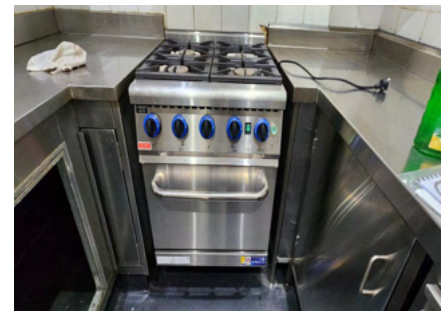
The Station has up- dated its kitchen up to regulations!