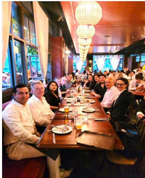
The station's Staff and Board celebrate a successful year of community service at the 2023 Christmas Dinner!